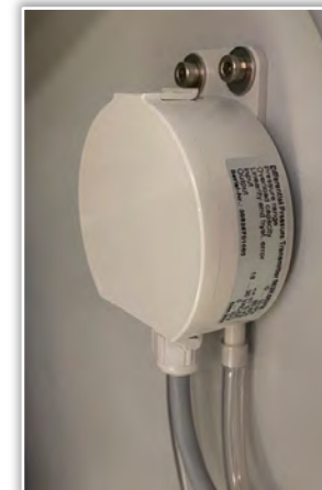
Monitoring filter condition via filter differential pressure