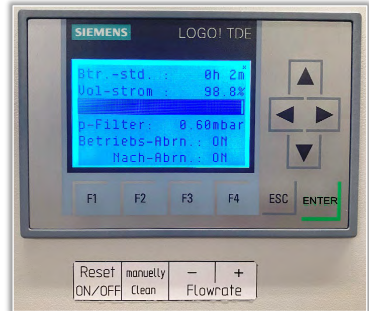
Easy to use control system