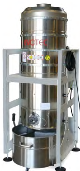
Example: EP 2702-M3PF-H-D80-60L